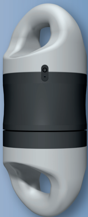
Nautilus Swivel 1000 to