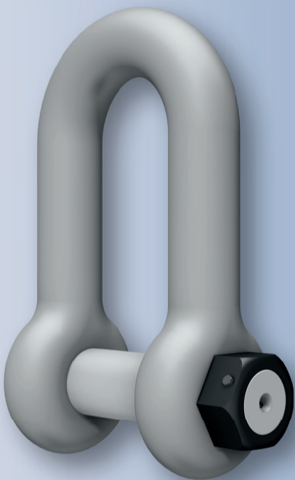
Mambo Shackle 900