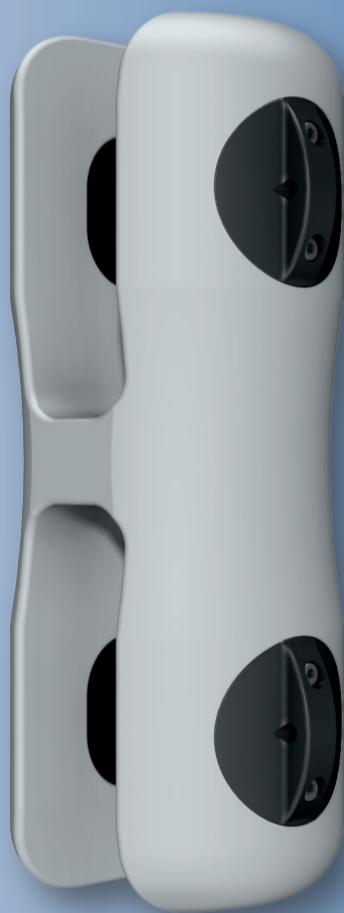
Hybrid H-Link 76mm + 84 mm