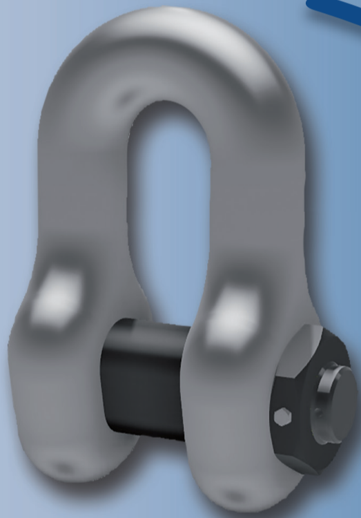
Special Joining Shackle D-Type 120 mm